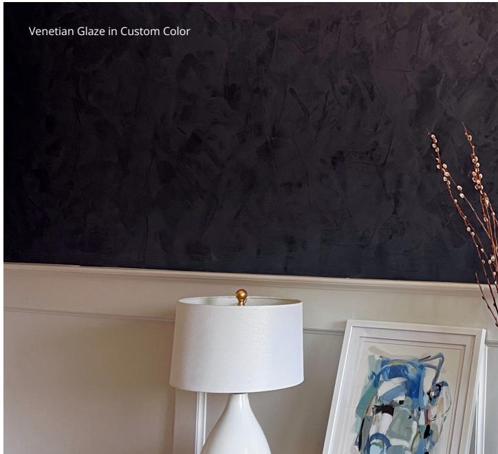
Venetian Glaze in Custom Color

for PLASTER-LIKE EFFECTS ON DRYWALL or COLOR SHIFTING ON BRICK OR STONE